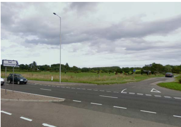
Entrance to East Cammachmore from A90

Residents said that the roads are generally well maintained, but with some pot-holes that need to be filled. It was also reported that wide vehicles have broken the edge of the carriageway in some places. The grass verges and the drainage of the roads are in need of regular maintenance. Drains need to be cleared more regularly and the where there is no pavement the edge of the carriageway need attention as it tends to become overgrown.