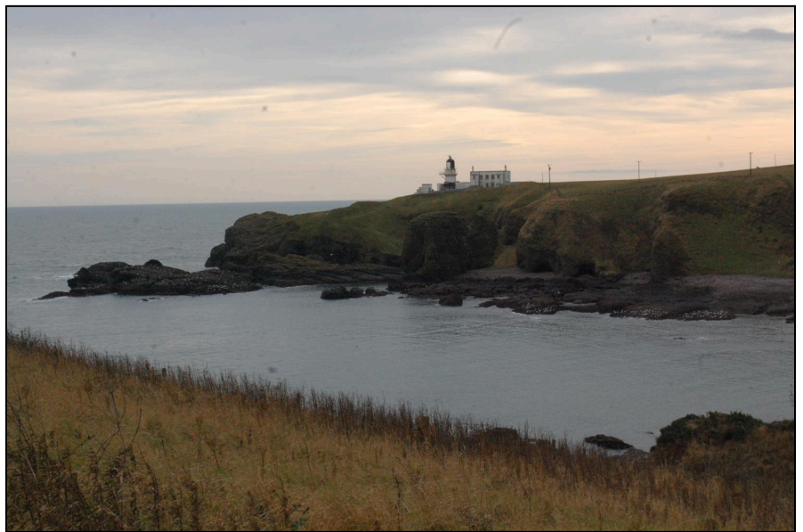
The Todhead Light across Braidon Bay