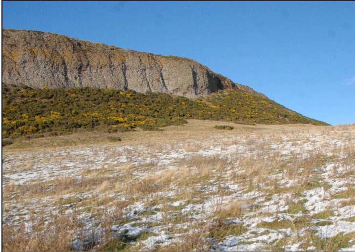
A wintery Bervie Brows